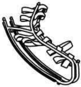
Ax1 A1x1 Fx7